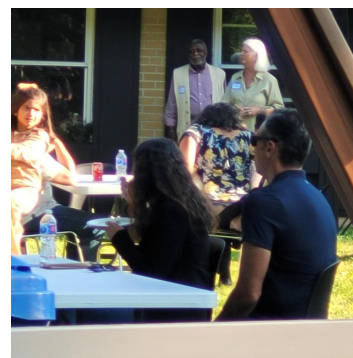
Photos of the Back to School Barbeque - By: Jasmine Bassaragh-Cross